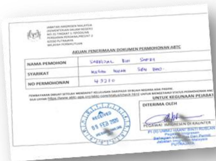
Example: "Slip Akuan Penerimaan Dokumen Permohonan ABTC" at APEC Service Counter